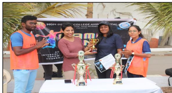
PLAYER OF THE TOURNAMENT – MGM DENTAL COLLEGE