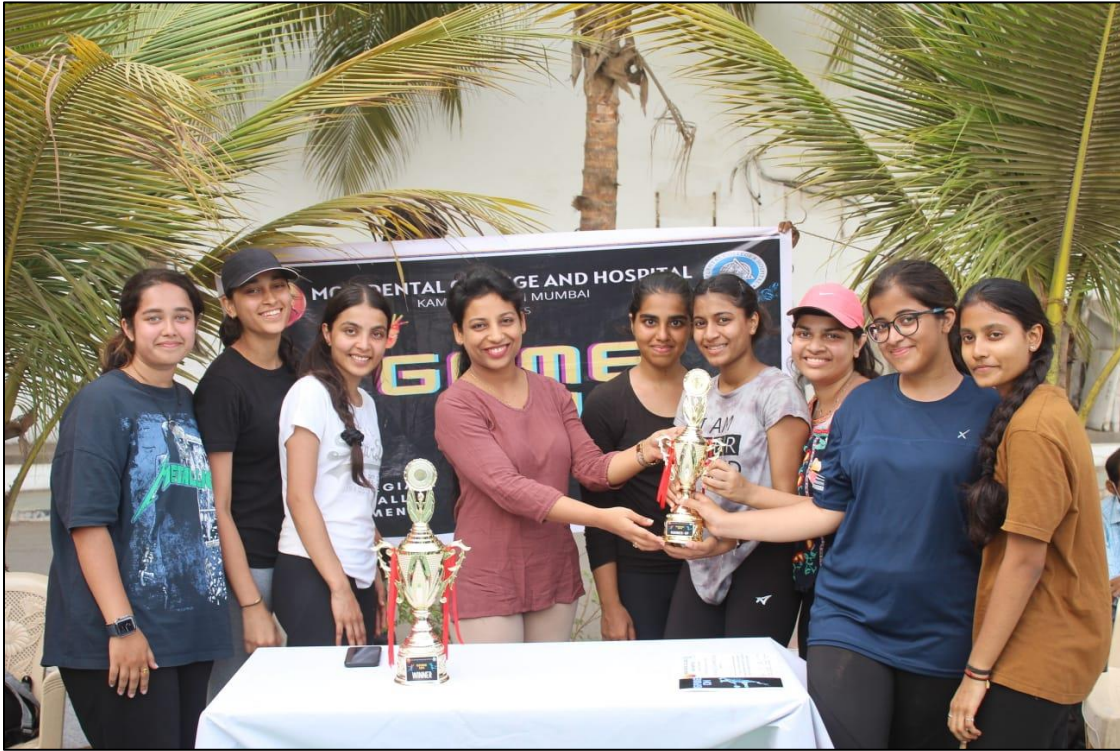
RUNNERS UP OF THE TOURNAMENT- D Y PATIL DENTAL COLLEGE