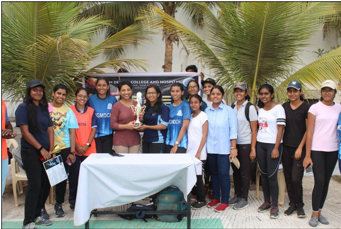
WINNERS OF THE TOURNAMENT – MGM DENTAL COLLEGE