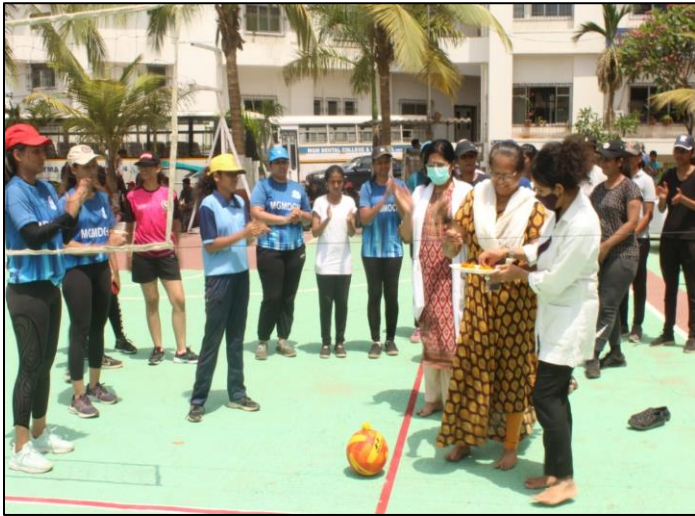
Inauguration of the event