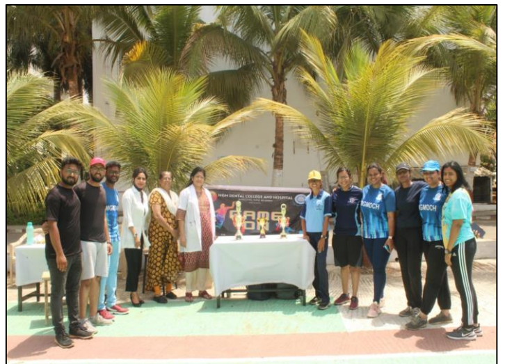
Final Day Of the tournament