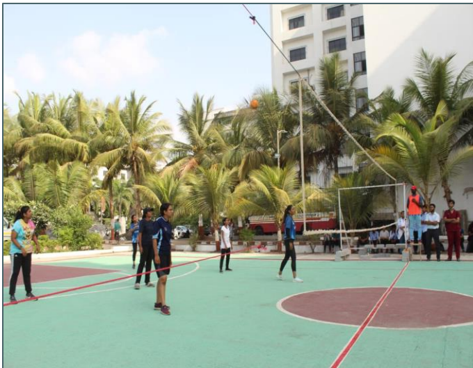
During The Tournament